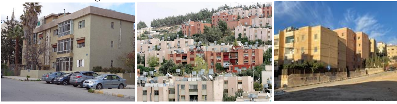
Figure 1. Affordable Housing Projects in Amman (Daheyat Al-Hussein neighbourhood, Abu Nseir Neghborhood, and Al- Mustanadah Negborhood).

Specifically, it investigates the Daheyat Al-Hussein neighborhood (1969-1986), Abu Nseir neighborhood (1981-1986), and Al-Mustanadah neighborhood (2008-2013). Tracing their historical backgrounds and assessing the identified housing quality indicators across residential units, buildings, and neighborhoods. By analysing these case studies, this chapter aims to extract insights into the effectiveness and challenges of affordable housing initiatives in Jordan and the extent to which these projects achieve the quality of housing indicators identified in the previous chapter, which ultimately informs future policy and planning efforts in the realm of housing.